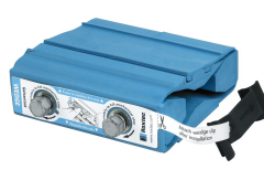
Wedge & Wedgekit